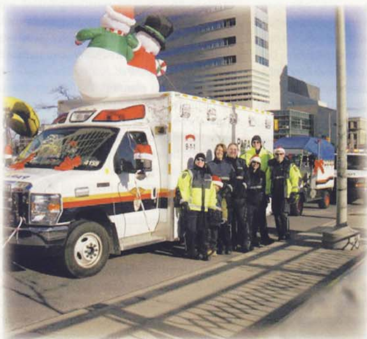
THE SANTA PARADES were a ton of fun.

a HELP Fund donation sheet located in the hotelling area at Paramedic headquarters. Donations can be as small as $1/month.