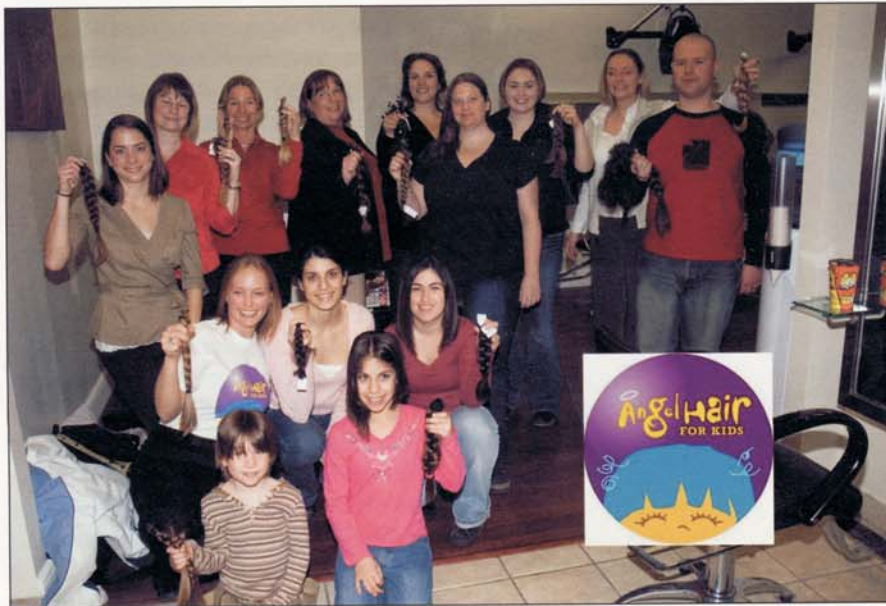
OTTAWA PARAMEDICS , communications officers and family members proudly display their donations.

from the audience. For example, have you ever thought about what could happen if you had just eaten a peanut butter sandwich and had to attend a call for a child having a peanut allergy?