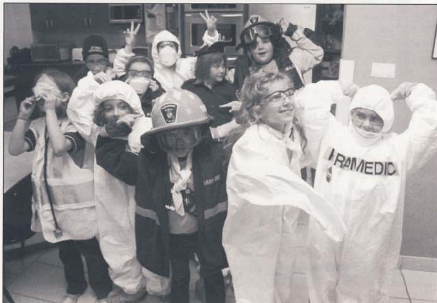
SEVERAL "FUTURE PARAMEDICS" trying on uniforms at HQ.